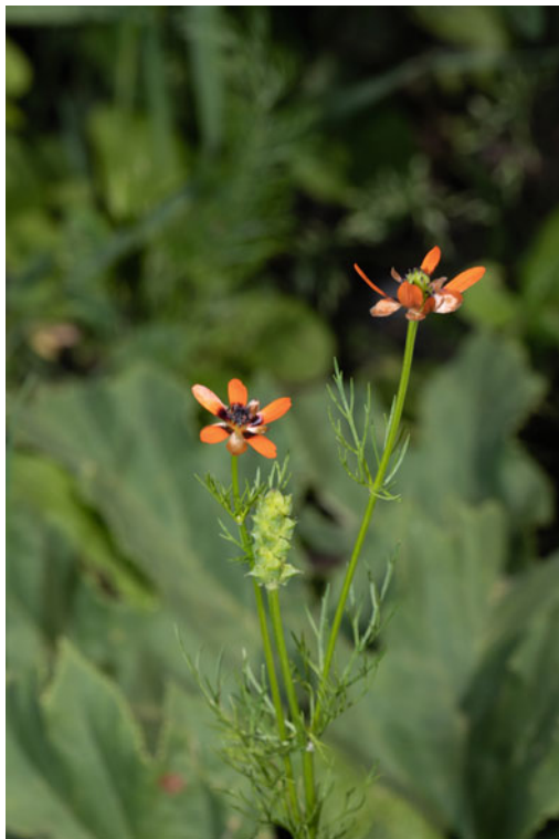
Fig. 3 Adonis aestivalis , Bakuriani, Georgia.